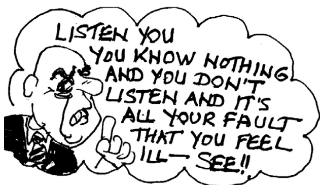
Figure 2 'Respect' (produced by a focus group participant).

With explicit reference to the findings of the project, the PCO set up a 'patient-centredness' group with the remit of reflecting the importance of relationships between patients and staff in the organisation's development planning process. Plans were partially implemented for exam-