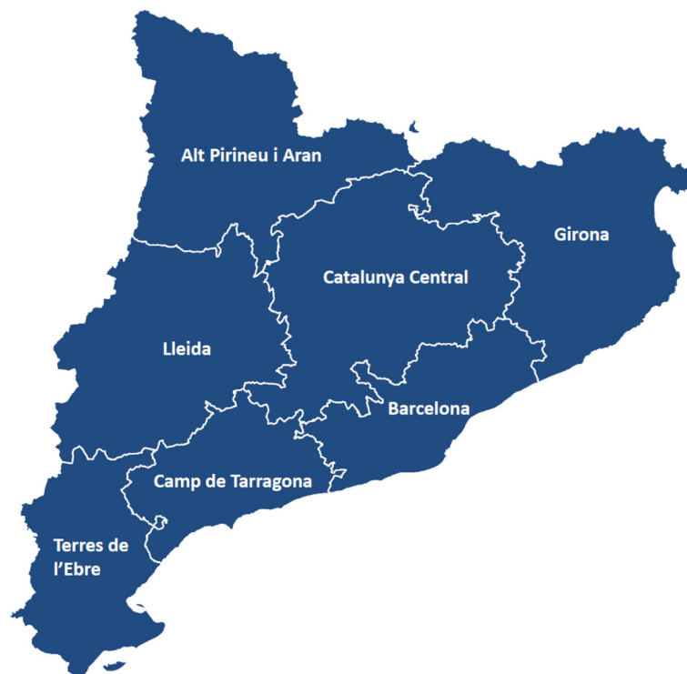
Fig. 2 The figure displays the seven health regions of Catalonia. The urban area of Barcelona (1.8 million citizens) has four health districts. The South-Eastern healthcare sector of the Barcelona city, which encompasses 520 k inhabitants, is Barcelona-Esquerra (AISBE). Taken from the Catalan Health Service (CatSalut) website. https://catsalut.gencat.cat/ca/coneix-catsalut/transparencia/territori/informacio-cartografica/mapes/ This is a public access image.

This protocol will take into consideration the entire population of healthcare users in Catalonia. The health system in Catalonia (7.5 M inhabitants) has three organisational levels, with the seven health regions at the top level (Fig. 2). Each region includes several geographical areas called health districts, second level, covering both specialised and primary care needs of the population. The third level corresponds to clusters of primary care centres within each healthcare district. The region has a