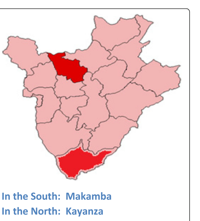
Fig. 1 The location of Makamba and Kayanza provinces. In the South: Makamba. In the North: Kayanza

Within each province, two health centers (HC) were chosen using two criteria: operating at the average provincial outpatient utilization rate of 2012 (MoH, 2013 unpublished data) and location in different environments.