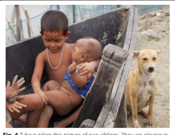
Fig. 4 "I have taken this picture of two siblings. They are playing in the water alone as there is nobody in the household to take care of them. Their parents have gone out to work." (Mother 46, age 37, secondary education, service, general caste)

young but she is already a mother. Both the mother and child are malnourished." (Mother 2, age 39, primary education, fisher woman, schedule caste)