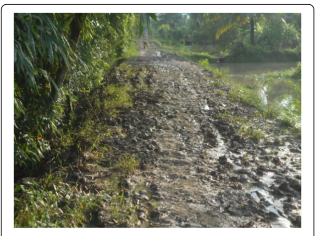
Fig. 5 "This is the main road of our island. It gets muddy in the slightest rain. We have to face real difficulty while travelling by this road." (Participant 19, age 47, secondary education, fisher woman, Scheduled caste)

During the group meetings mothers explained that some important determinants of child health could not be captured through photographs. The first such determinant is the unavailability of the medical practitioners in their respective villages. One mother stated: "We do not have doctors in our village. Even village doctors (informal health practitioners) are not available all the time due to the bad condition of the roads." (Mother 75, age 32, primary education, fisher woman, schedule caste). Mothers also raised the issue of non-availability of veterinarians for treating