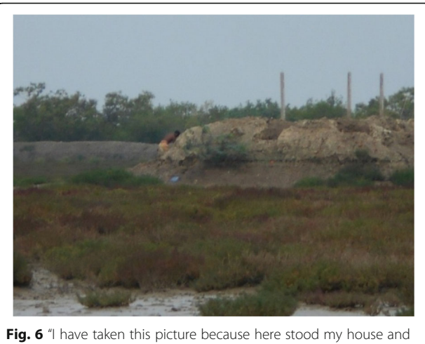
Fig. 6 "I have taken this picture because here stood my house and my agricultural land till last year's floods. Since then we have been staying at our neighbour's place and this depresses my children... After [Cyclone] Aila, nearby ponds became salty and fish cannot survive in the saline water. It has reduced the amount of nutritious food on the children's plate." (Mother 39, age 45, illiterate, crab catcher, general caste)

their animals, as they are important resources for household food security for the children. "We do not have any veterinary doctor here. In the recent past a lot of livestock have died of unknown ailments and each time we are faced with a loss of the family resource" (Mother 5, age 46, illiterate, crab catcher, schedule tribe).