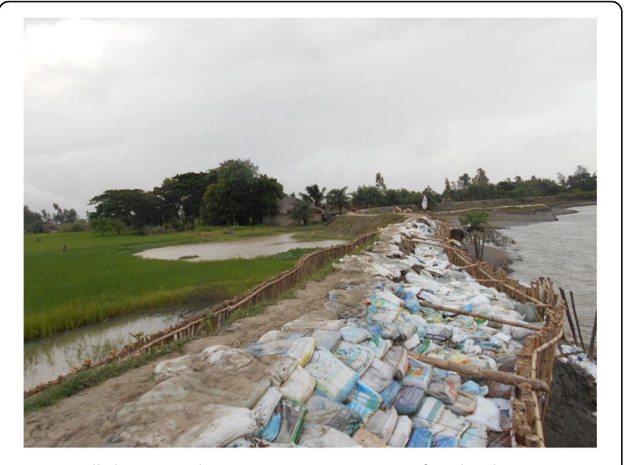
Fig. 7 "All these are the temporary structures of embankment, whereas we need concrete ones. Almost every year our house gets flooded during the monsoon." (Mother 55, age 23, secondary education, fisher woman, general caste)